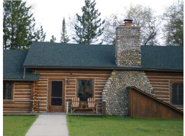
They don't build 'em like this anymore!

The Elliott Donnelley Chapter has a standing reservation at the Wa Wa Sum lodge, situated right on the banks of the Au Sable. It is a magical, rustic place where you swear you can feel the history in its log cabin walls. If you've never been, put it on your calendar to attend next year!