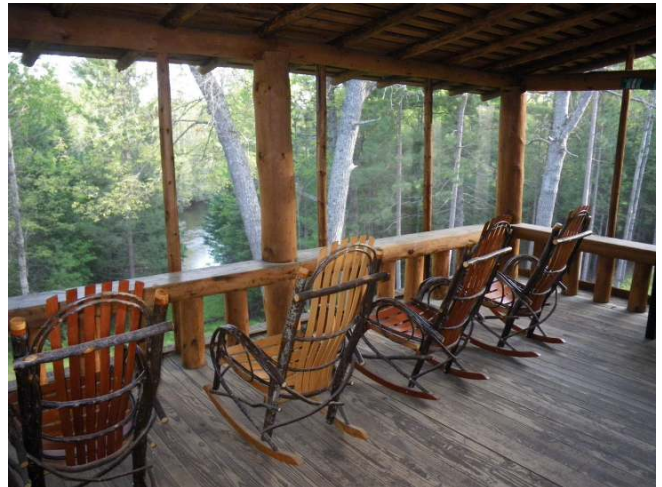
And yes, that is the Au Sable River "Holy Water" visible right off the wonderful Wa Wa Sum porch